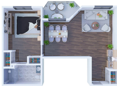
B2 574 SQ FT