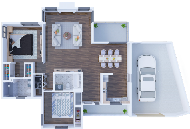
A3 Cottage 1,053 SQ FT