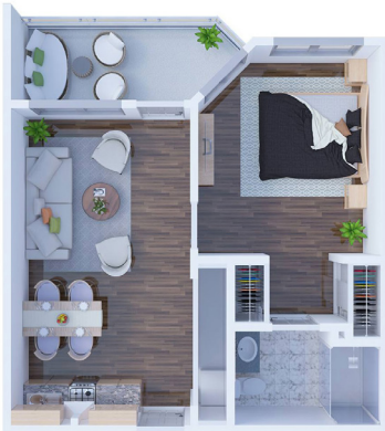
B1 545 SQ FT