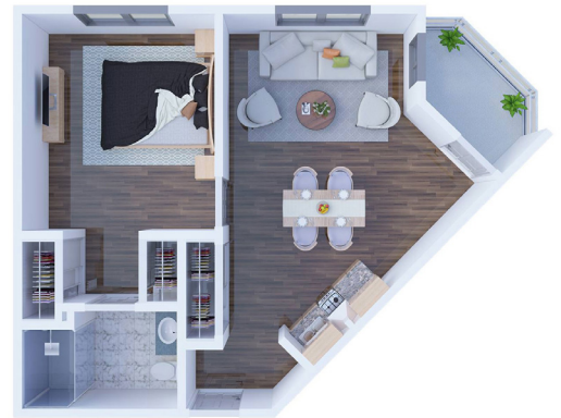
B5 737 SQ FT

Solstice Senior Living at Grand Valley 3260 N. 12th Street, Grand Junction, CO 81506 (844) 913-7230 SolsticeSeniorLivingGrandValley.com