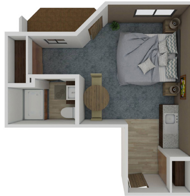
A2 432 SQ FT