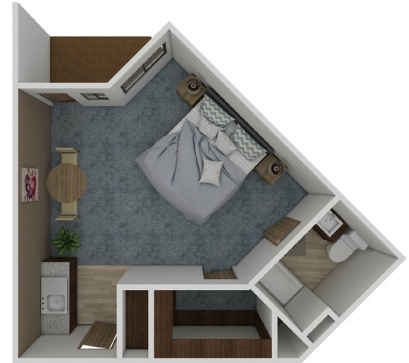
A4 509 SQ FT