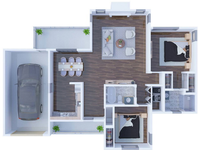
A1 Cottage 1,165 SQ FT