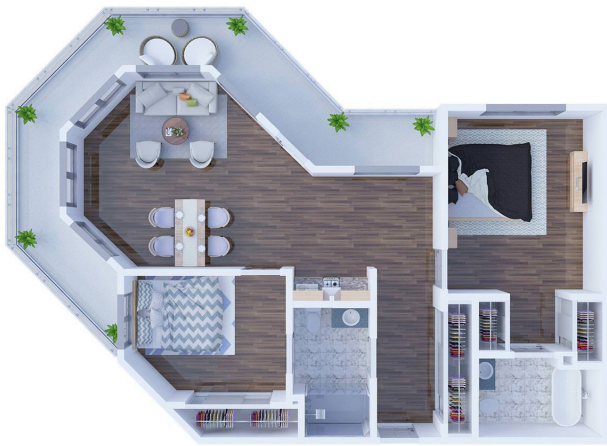
C1 Cottage 901 SQ FT