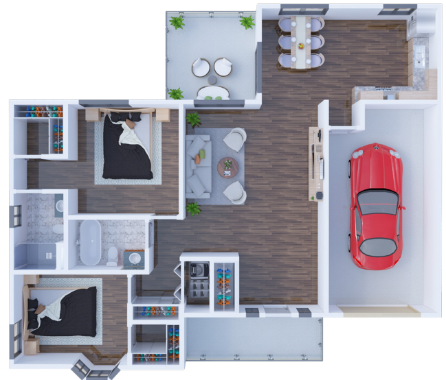
B1 Cottage 1,375 SQ FT