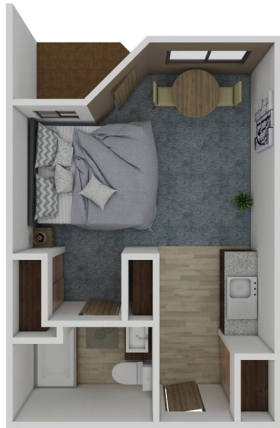
A1 398 SQ FT

Solstice Senior Living at Grand Valley offers several floor plan choices to suit your needs.